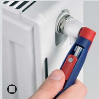
Square for air bleeding (Article No. 00 11 07 + 00 11 08)