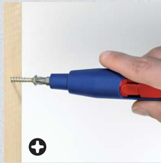
Tightening a screw with cross recess bit PH2 (Article No. 00 11 07 and 00 11 08)